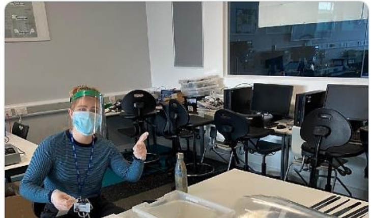
Vital equipment produced for NHS front-line at LAET www.tottenhamhotspur.com