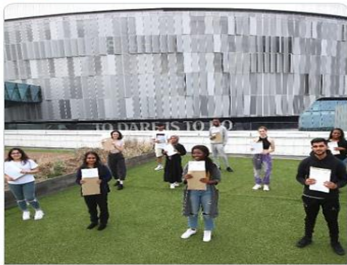
Oxbridge calling for Tottenham students @tottenhamhotspur.com 21 43 797

You Retweeted Tottenham Hotspur @SpursOfficial · 14h 10 current students at @LAEtottenham have been offered places at Oxford or Cambridge Universities for the next academic year, beginning September 2021 🎉 More #THFC #COYS